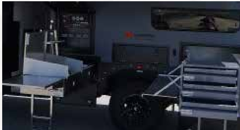
Luxury kitchen with heaps of drawers and storage all around, room for a 95L fridge and added stainless steel drop down