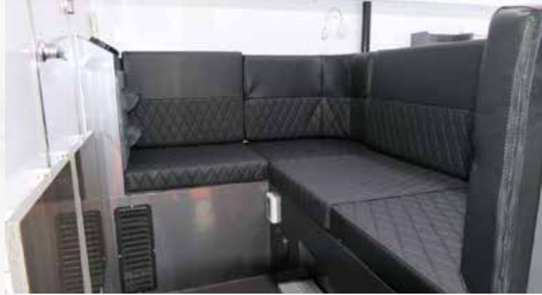
Internal lounge seating L shaped with under bed access as well