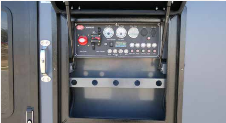
Main controls at doorway, easy to access water tank meters & battery monitor