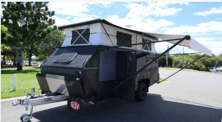
Full roll out awning with optional full enclosed kit which comes with all the side walls, floor & draft skirt PLUS a privacy screen