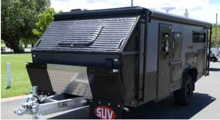
Front storage box consists of 2 x 4kg gas bottle holders, pole carrier & 2kva genny storage with built in stone deflectors