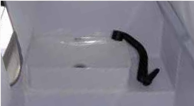
Vanity unit with tap & shower rose and mirror