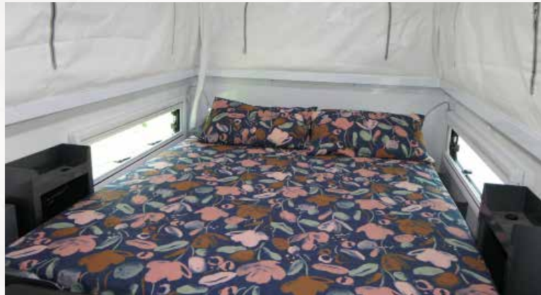
2000x1700mm innerspring mattress, luxury couch with spring around table, lift up storage and access under bed on gas struts