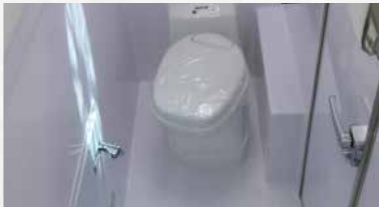
Seperate toilet area from shower area