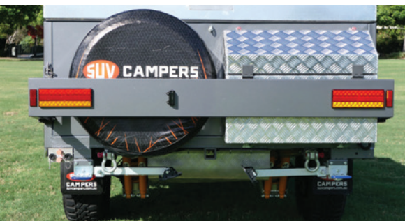
Spare Tyre & Storage Box