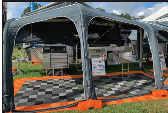
Full Annex with Side Walls, Draught Skirt & Floor (OPTIONAL EXTRA)