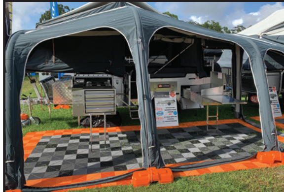
All New Air Annex Upgrade with Side Walls, Draught Skirt & Floor (OPTIONAL EXTRA)