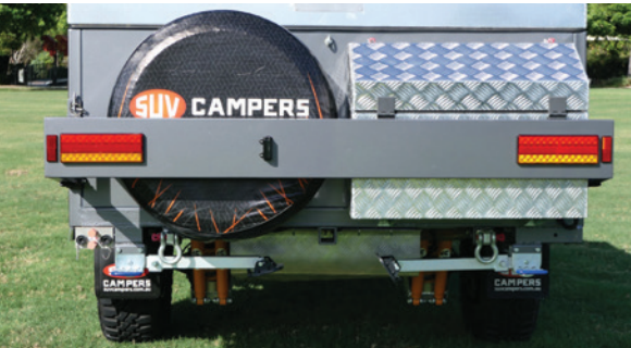
Spare Tyre & Storage Box