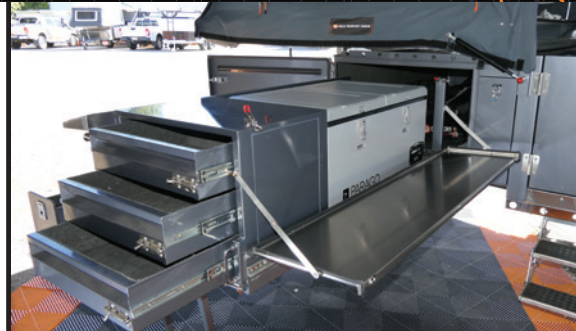
Latest Pantry/Fridge Slide