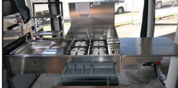
Engineer Designed Gas System & AGA Approved 4 Burner Gas Stove with Sink & Utensils Drawer