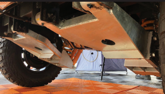
Latest Series 4 Heavy Duty Suspension with Bolt on Stub Axle