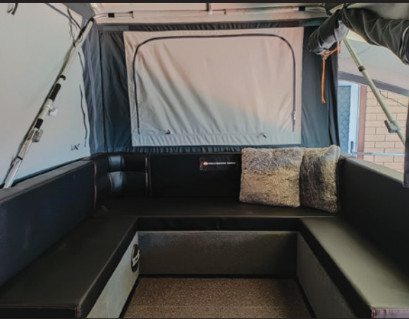
Luxury Club Lounge that folds to a Double Bed