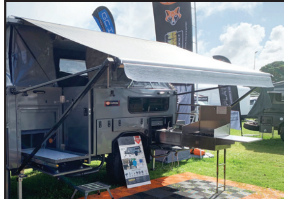
Roll Out Caravan Awning & Electric Lift Roof