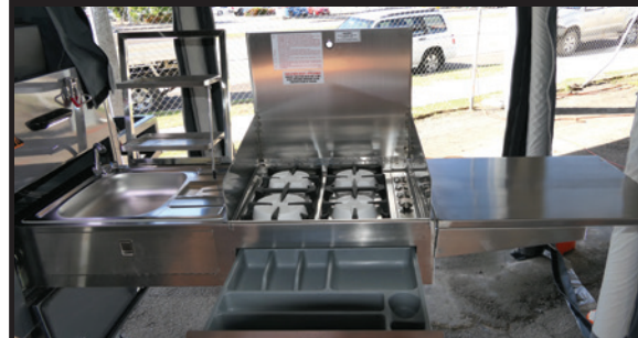
Engineer Designed Gas System & AGA Approved 4 Burner Gas Stove with Sink & Utensils Drawer