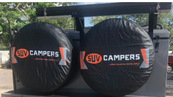
2 x Spare Tyres