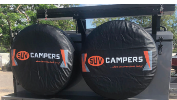
2 x Spare Tyres