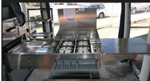
Engineer Designed Gas System & AGA Approved 4 Burner Gas Stove with Sink & Utensils Drawer