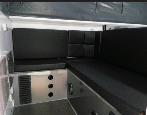
Luxury Club Lounge