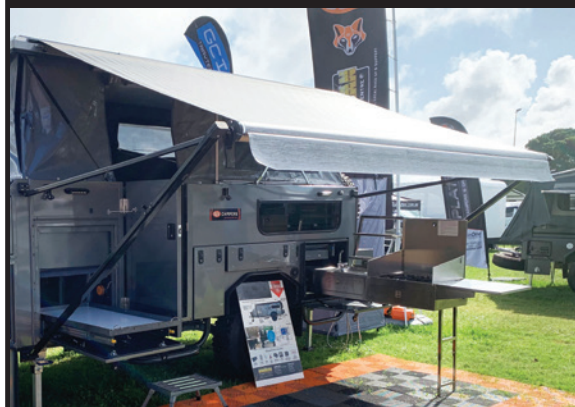
Roll Out Caravan Awning & Electric Lift Roof