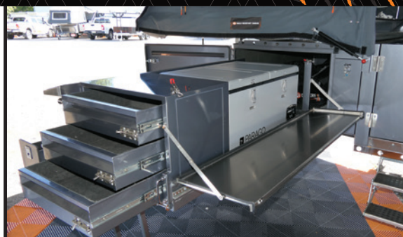
Latest Pantry/Fridge Slide