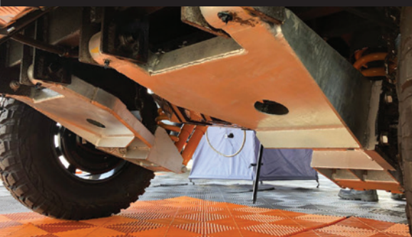
Latest Series 4 Heavy Duty Suspension with Bolt on Stub Axle