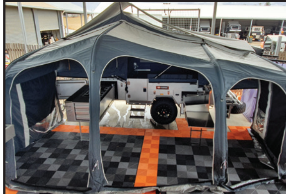
Full Annex with Side Walls, Draught Skirt & Floor (OPTIONAL EXTRA)