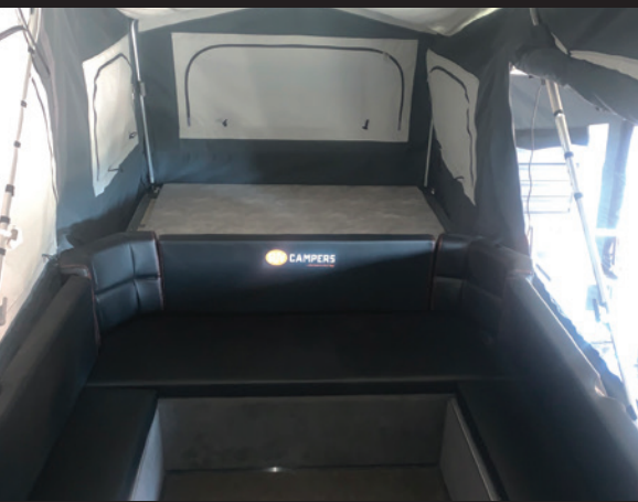
Luxury Club Lounge that folds to a Double Bed