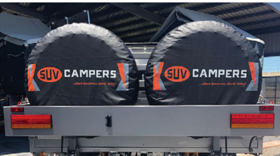
2 x Spare Tyres