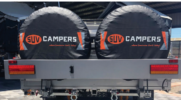
2 x Spare Tyres