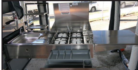
Engineer Designed Gas System & AGA Approved 4 Burner Gas Stove with Sink & Utensils Drawer