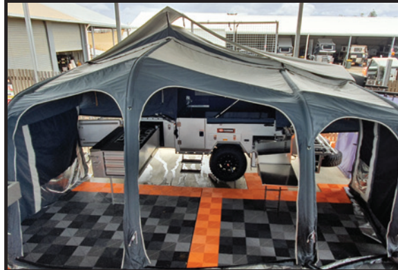
Full Annex with Side Walls, Draught Skirt & Floor (OPTIONAL EXTRA)